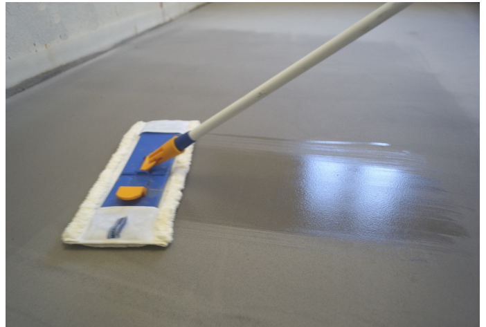
Then apply the Premium varnish on the still wet floor by circular motion.