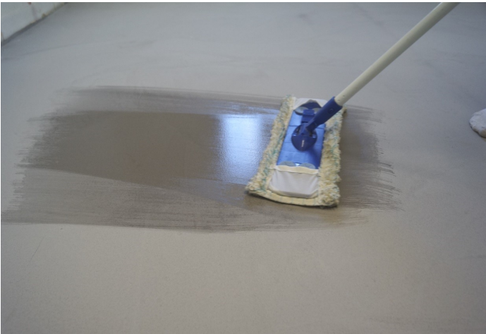
Humidify the floor with a micro fiber mop or a broom mop.