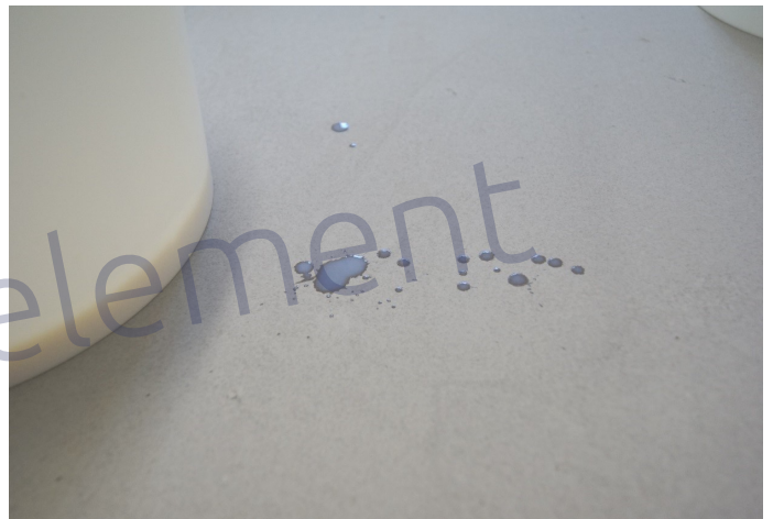
Be careful to drops of varnish because the marks will remain.