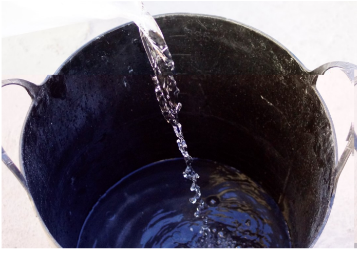
Pour 6 I to 6.2 I of water in the 40 L bucket