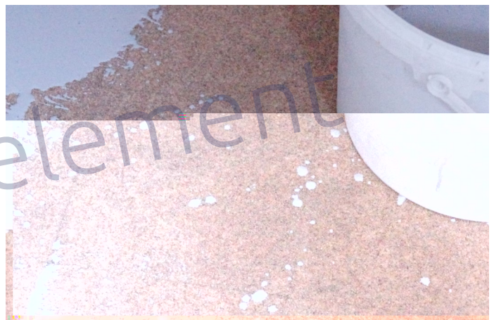
Beware of drops. Provide a bucket to put the Flemish in and avoid the drops on the ground.