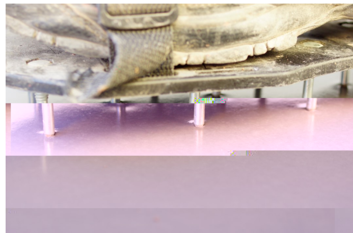
Use nail shoes to move in smooth concrete when needed.