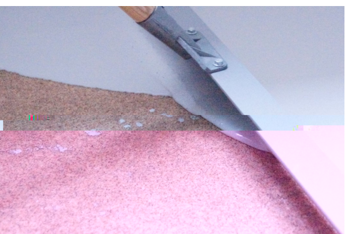
Pull the concrete smooth with the ruler so that it has the same thickness everywhere.