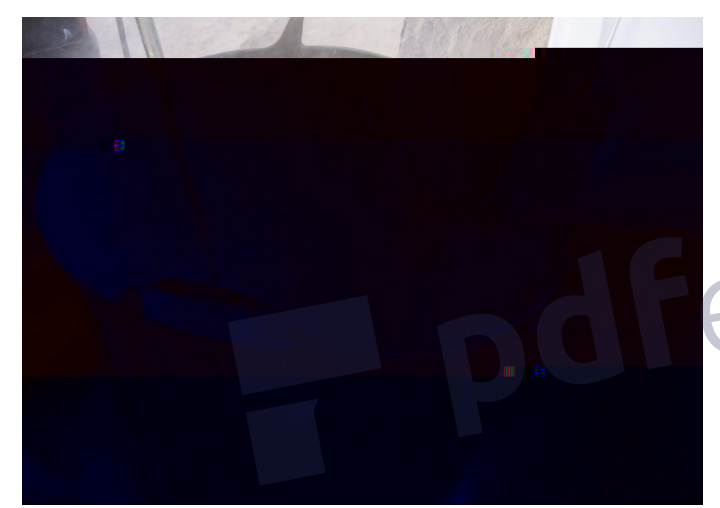
Pour the powder of the smooth concrete and mix for 2 to 3 minutes maximum at medium speed.