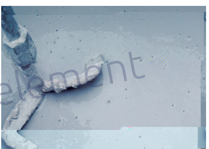
Let rest 1 min so that air bubbles rise, then mix again for 30 seconds.