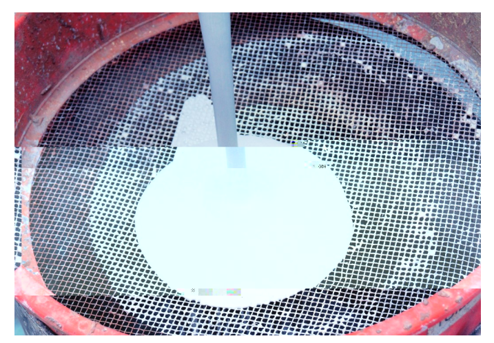
Pass then the mixture through the sieve in order to remove all the lumps.