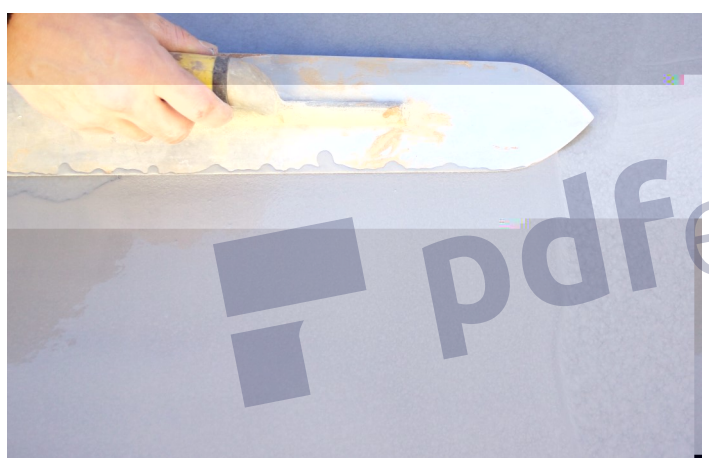
Help yourself with the Flemish to put up against the walls