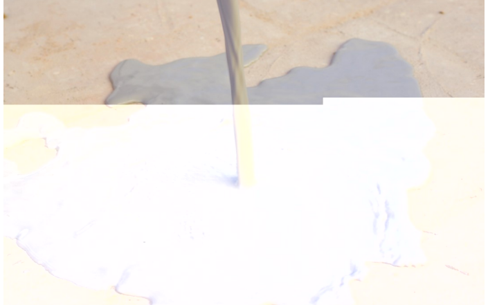
Pour the wheat on the ground in a regular and uniform way.